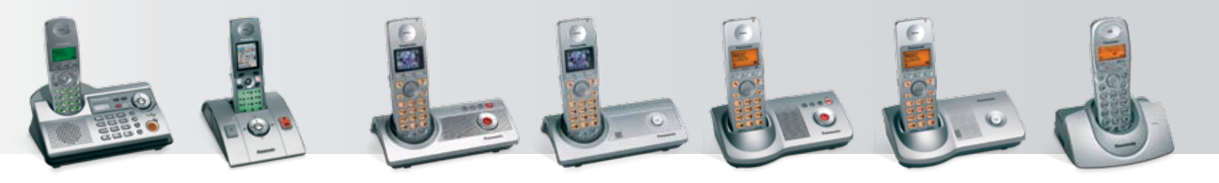
KX-TCD240ES MARC'S CALL PAGE 12

PANASONIC DECT PHONES, ANSWERING SYSTEMS AND LIFESTYLE TECHNOLOGIES.