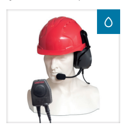
CHPHS/DT9* Single sided ear defender headset for hard hat use