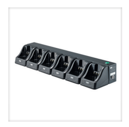
CSBHT Intelligent six-pod rapid charger

Supplied package includes: Li-ion battery pack, drop-in charger, belt clip, high-efficiency antenna and quick-start user guide.