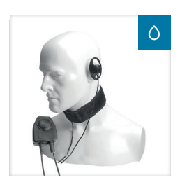
CXR16/DT9* Throat mic / earpiece with heavy duty PTT