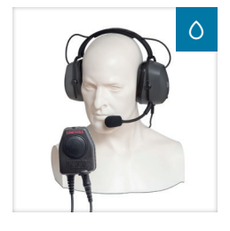
CHPD/DT9* Double sided ear defender headset with headband