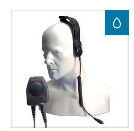
CXR5/DT9* Bone conductive skull mic with heavy duty PTT