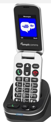
Hands-free charging base