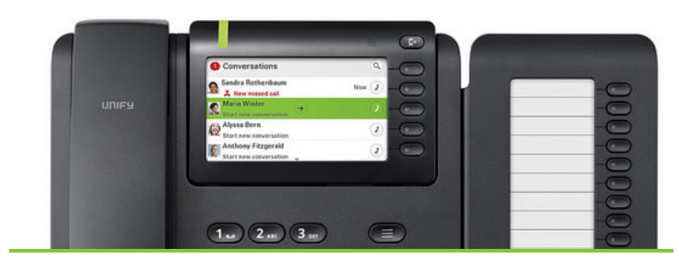
CP600 and optional KM600 key module

Expand interaction while increasing responsiveness with optional OpenScape Desk Phone Key Modules. For users needing simplified access, whether receptionists, administrative staff, managers or executives, these modules give single-button access to the people and features they use most.