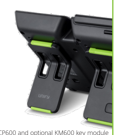
CP600 and optional KM600 key module