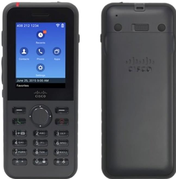
Figure 1. Cisco Wireless IP Phone 8821