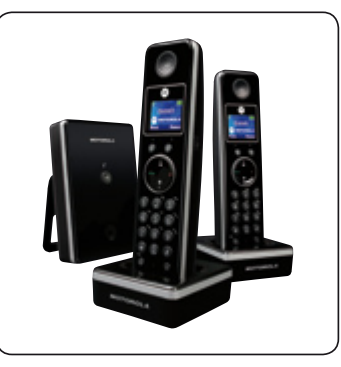
D802 - Twin Pack