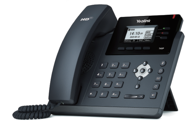
Optima HD Voice