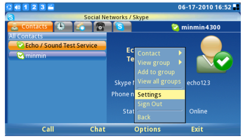
Figure 8: Skype Settings

The General Settings tab (See Figure 9) allows users to configure general Skype settings including setting the period of time (in minutes) before showing the user as "Away" when the user is inactive. The time duration for keeping call history information can also be set by selecting a length of period from the "Keep history for:" menu. To clear call history, users simply need to select the button titled "Clear History". For automatic user login after powering on the GXV3140, the "Start Skype when I start the phone" checkbox should be selected. To properly save all these settings successfully, users must press the "Save" soft key button.