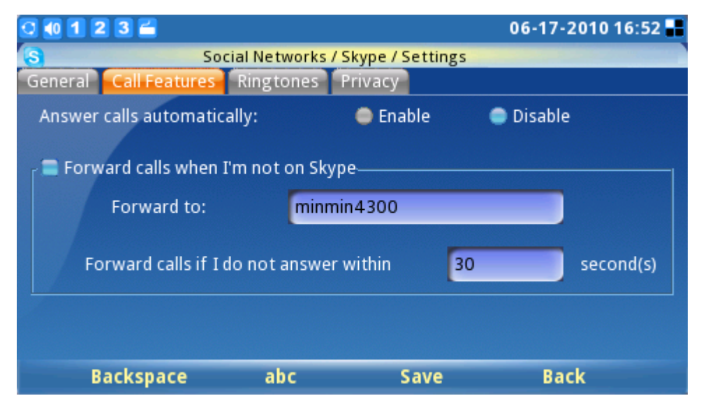
Figure 10: Skype Call Features Settings

ring unanswered before the call is forwarded. To properly save all these settings successfully, users must press the "Save" soft key button.