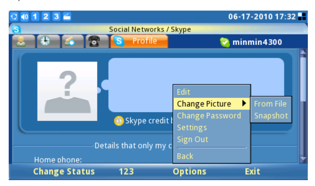
Figure 29: Select Skype profile photo

To change the display avatar picture, users can select photos from an existing file or from a snapshot. (See Figure 29)