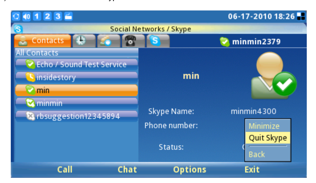
Figure 31: Quit Skype

To exit Skype application, press the "Exit" soft key. (See Figure 31) Selecting "Minimize" keeps the Skype application open and navigates the user to the main menu with a small Skype icon ( ) shown in the right corner of the screen. Keeping the application live or minimized eliminates the need to sign into Skype again for making or receiving calls later. If "Quit Skype" is selected, automatic sign in is available (if configured) next time the user starts Skype.