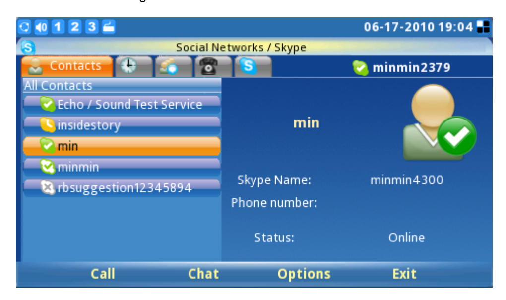
Figure 19: Skype Contact List

To chat with a Skype contact, go to the tab "Contact" and select the contact person. (See Figure 19) Press "Chat" to initiate the chatting window.