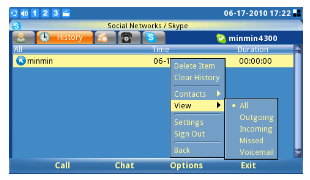
Figure 25: View Skype Call History

To view the history of all call events, users can scroll to the "History" tab. By pressing the "Options" soft key, users can delete selected items or clear all history. The ability to remove or block contacts is also available by choosing "Contacts" on one of the selected items in the history list. To view history information in different categories, users can select "View" and press "All", "Outgoing", "Incoming", "Missed" or Voicemail. (See Figure 25)