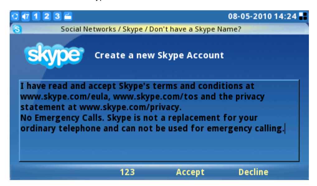
Figure 4: Skype Disclaimer

Next, check "Accept" to accept Skype's agreement terms. (See Figure 4) Users will be required to provide valid information to create a new Skype account.