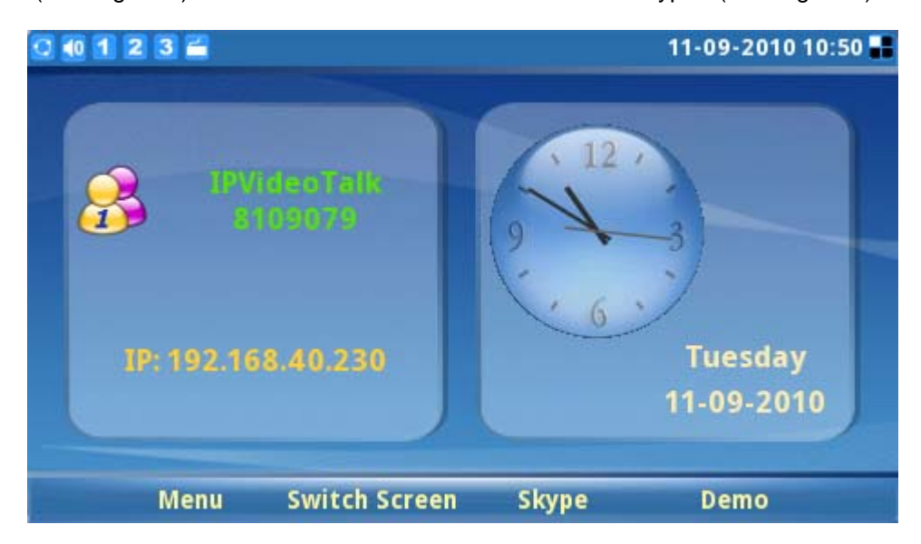
Figure 1: Launch Skype Application in Idle Screen

Skype is an IP telephony software application that enables millions of users to communicate by initiating and receiving free voice and video calls to other Skype users on computers, mobile devices and other GXV3140 phones. To access Skype on the GXV3140, users could press F3 button underneath "Skype" in IDLE screen (See Figure 1) or select "MENU"-> "Social Networks"-> "Skype". (See Figure 2)