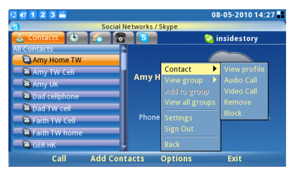
Figure 7: Skype Options Menu

After signing in, the user's contact list will be displayed, showing the status information and profile of the contacts on the right-hand window. Additionally, users can add contacts by selecting "Options"-> "Contact"->"Add". To view detailed contact information, select "View profile". The ability to remove, block/unblock a contact is also available by selecting the appropriate button in the "Contact" window. (See Figure 7)