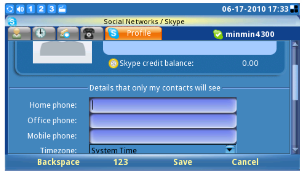
Figure 28: Edit Skype Profile Information Screen

To change the display avatar picture, users can select photos from an existing file or from a snapshot. (See Figure 29)