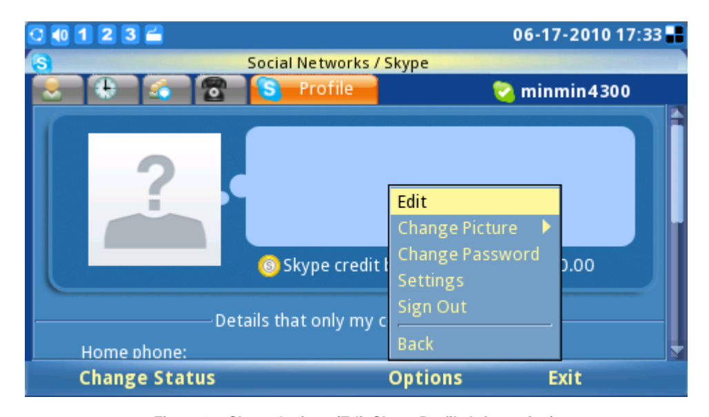
Figure 27: Skype Options (Edit Skype Profile Information)

To edit the user profile displayed in others' contact list, press "Option"-> "Edit" (See Figure 27) then enter the detailed information for items like home phone, office phone, etc. (See Figure 28) Press "Save" to save any edits.