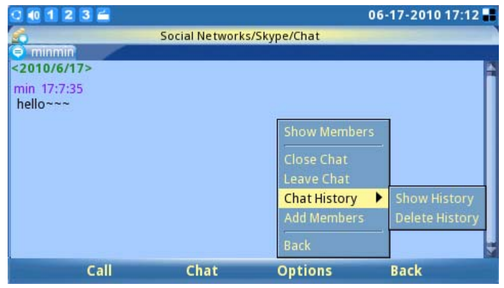
Figure 22: Skype Chat History

To add members to a chat, select "Options"-> "Add members" and add a buddy from the contact list. (See Figure 23) Select the contact and press "Add"-> "OK". Once the contact joins, everyone in this group chat room is able to chat with each other.