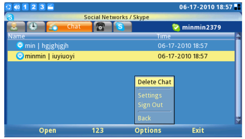
Figure 24: Delete Skype Chat