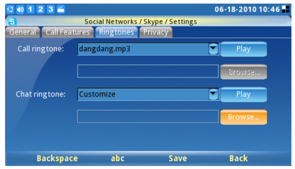
Figure 12: Skype Ringtones Setting

The Privacy tab (See Figure 13) is very important as it controls incoming calls, chats and personal information exposed to other Skype users. Select "Anyone" or "Only people from my contacts" to set the privileges for incoming calls, chats, phone number view and avatar view. To let others see the contact list, select the "Show how many contacts I have" option. To allow other Skype users to see the status of a call, users should check "Allow my status to be shown on the web". To properly save all these settings successfully, users must press the "Save" soft key button.