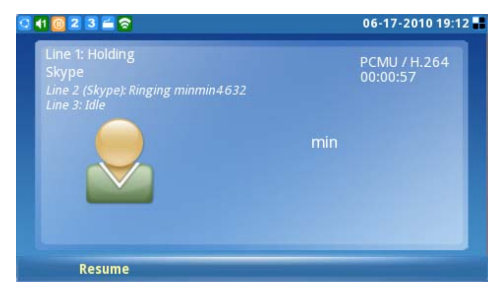
Figure 17: Skype Call Hold

The GXV3140 supports call hold/resume when using Skype. While on an initial call another call request comes in, press the line button ( ) on the GXV3140 and select the line where the corresponding conversation should be established (See Figure 17). To resume the initial call placed on hold, the user should select the line by pressing the line key and selecting the line to switch between the calls.