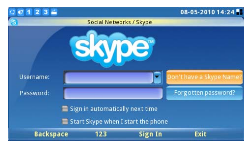
Figure 3: Skype Login Screen

have a pre-existing Skype account, a new account can be created using the Skype application login page on the GXV3140. Select the "Don't have Skype Name?" button to be navigated through the registration process. (See Figure 3)