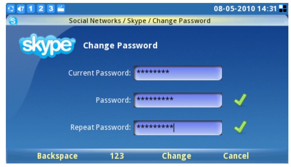
Figure 30: Change password for Skype