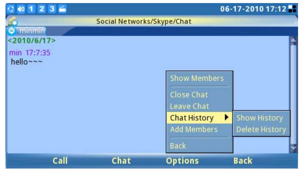
Figure 20: Skype Chat Options

To chat, enter the message in the window and press "Send". The message, name and timestamp will be displayed in the window. To exit the chat, press "Cancel". (See Figure 21)