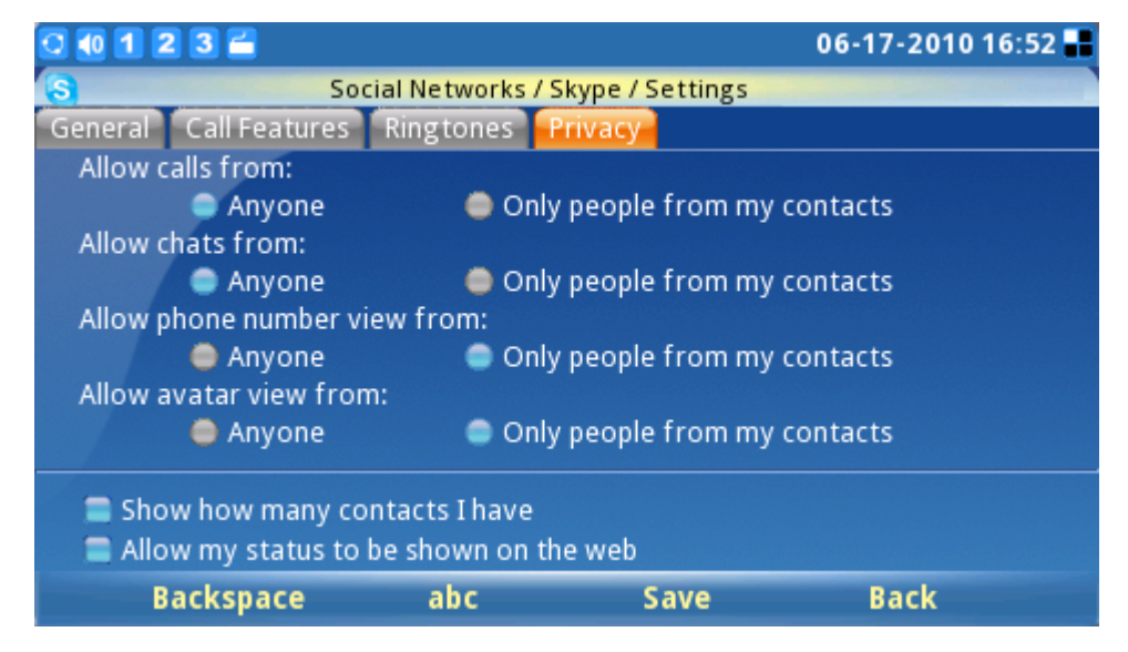
Figure 13: Skype Privacy Setting

The Privacy tab (See Figure 13) is very important as it controls incoming calls, chats and personal information exposed to other Skype users. Select "Anyone" or "Only people from my contacts" to set the privileges for incoming calls, chats, phone number view and avatar view. To let others see the contact list, select the "Show how many contacts I have" option. To allow other Skype users to see the status of a call, users should check "Allow my status to be shown on the web". To properly save all these settings successfully, users must press the "Save" soft key button.