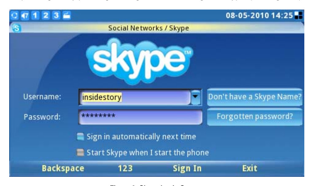
Figure 6: Skype Login Screen

Users with a pre-existing Skype account can login to Skype by simply entering the correct username and password. Complete sign-in by pressing the "Sign-In" button to login to Skype. (See Figure 6)