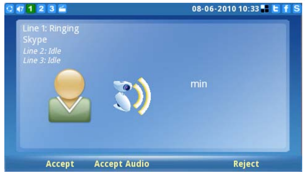
Figure 16: Incoming Skype Call Screen

The GXV3140 supports call hold/resume when using Skype. While on an initial call another call request comes in, press the line button ( ) on the GXV3140 and select the line where the corresponding conversation should be established (See Figure 17). To resume the initial call placed on hold, the user should select the line by pressing the line key and selecting the line to switch between the calls.