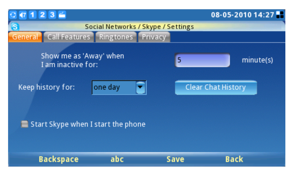
Figure 9: Skype General Settings

The General Settings tab (See Figure 9) allows users to configure general Skype settings including setting the period of time (in minutes) before showing the user as "Away" when the user is inactive. The time duration for keeping call history information can also be set by selecting a length of period from the "Keep history for:" menu. To clear call history, users simply need to select the button titled "Clear History". For automatic user login after powering on the GXV3140, the "Start Skype when I start the phone" checkbox should be selected. To properly save all these settings successfully, users must press the "Save" soft key button.