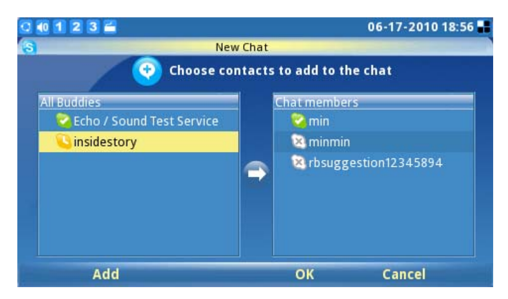
Figure 23: Adding contacts to Skype chat

To add members to a chat, select "Options"-> "Add members" and add a buddy from the contact list. (See Figure 23) Select the contact and press "Add"-> "OK". Once the contact joins, everyone in this group chat room is able to chat with each other.