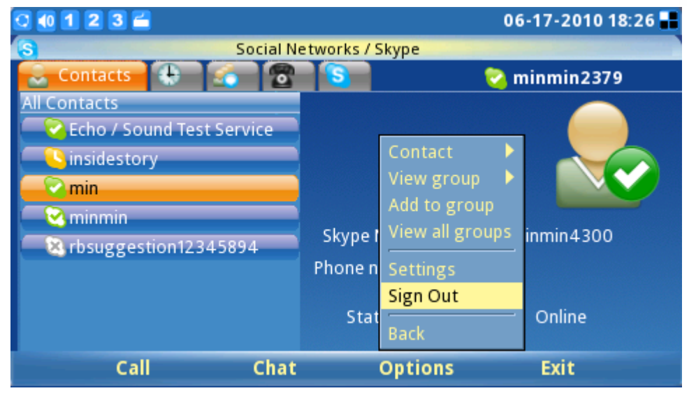
Figure 32: Sign out from Skype