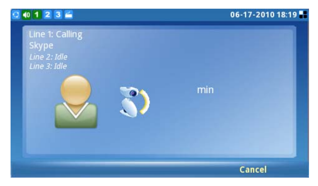
Figure 15: Placing a call with Skype

To place an audio only call, select the contact and then select "Options"->"Contact"->"Audio Call". Figure 15 depicts the screen when a call is being dialed out. To cancel the call before the connection is established; simply press the "Cancel" soft key button.