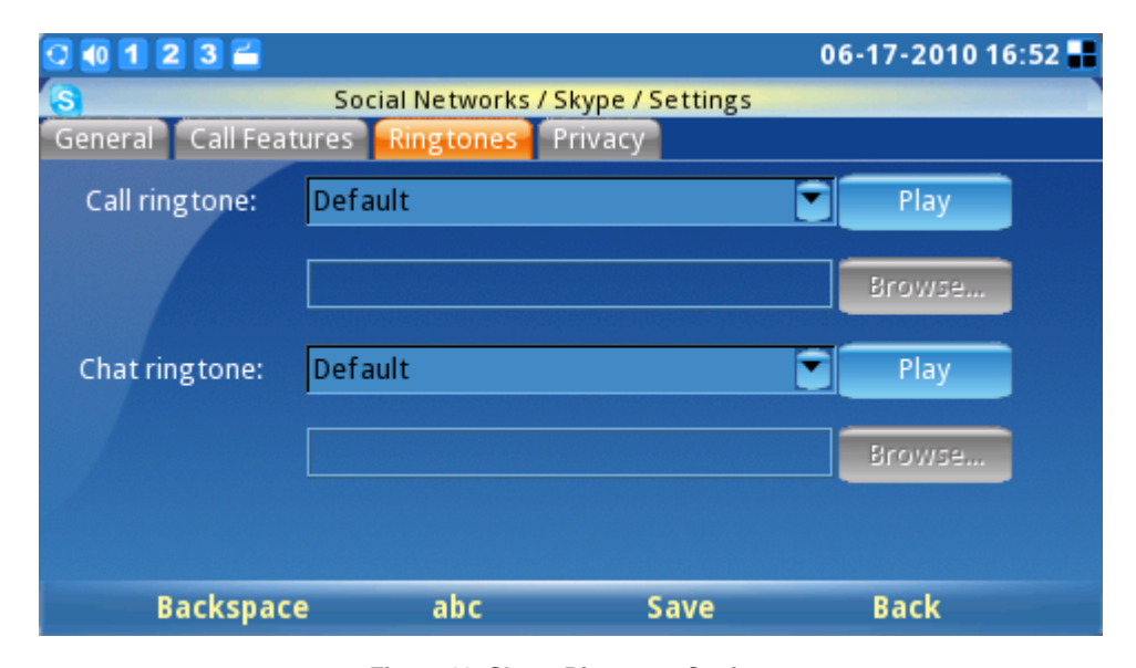
Figure 11: Skype Ringtones Setting

The Ringtones tab (See Figure 11) allows users to change and customize ringtones for both the call and chat function. To hear the current ringtone, press "Play" next to drop down menu.