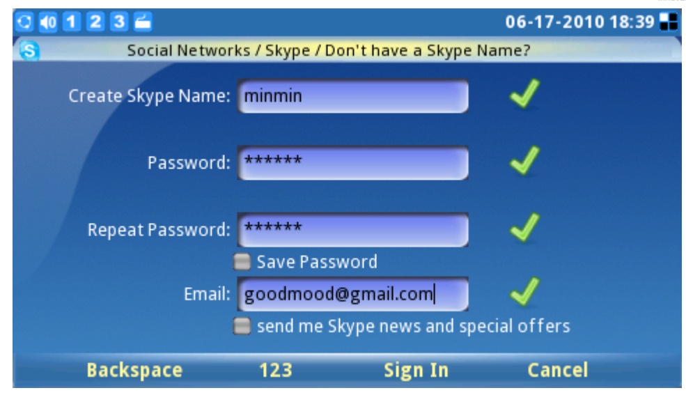
Figure 5: Creating a new Skype account