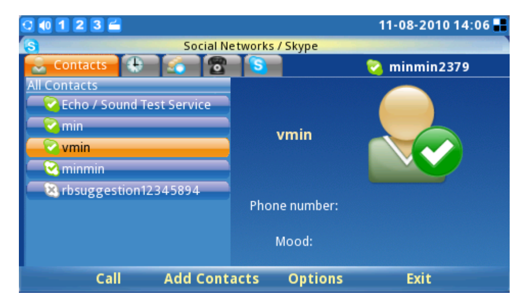
Figure 14: Skype Contacts List

To place an audio only call, select the contact and then select "Options"->"Contact"->"Audio Call". Figure 15 depicts the screen when a call is being dialed out. To cancel the call before the connection is established; simply press the "Cancel" soft key button.