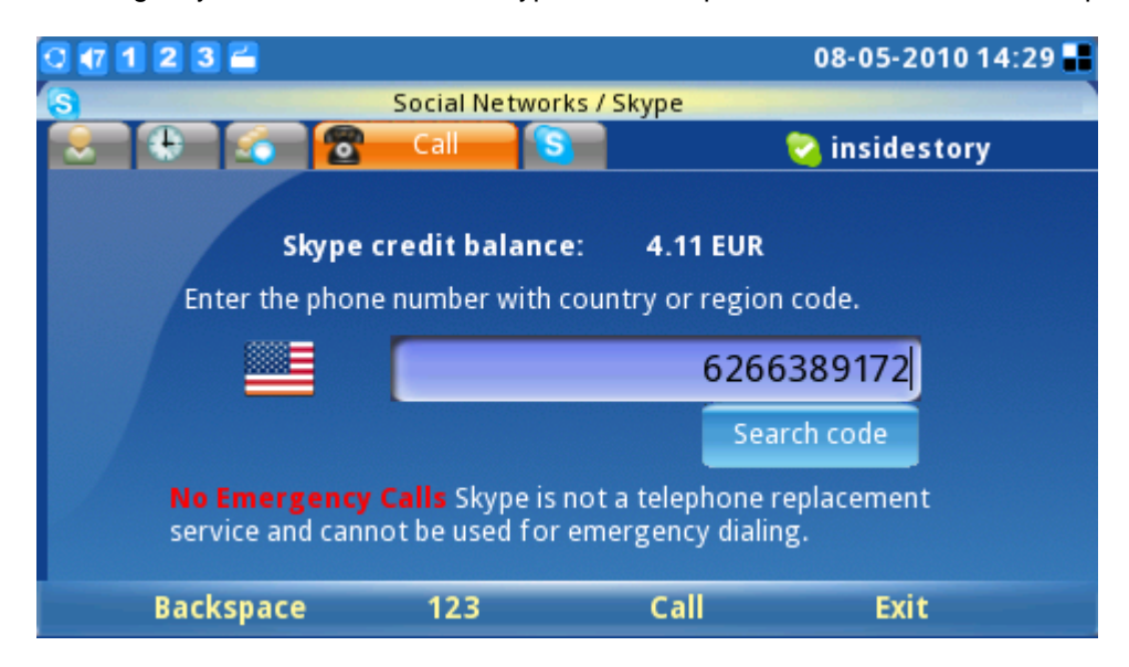
Figure 18: Skype Out Call Screen

WARNING : No emergency calls are allowed as Skype is not a replacement for a standard telephone.