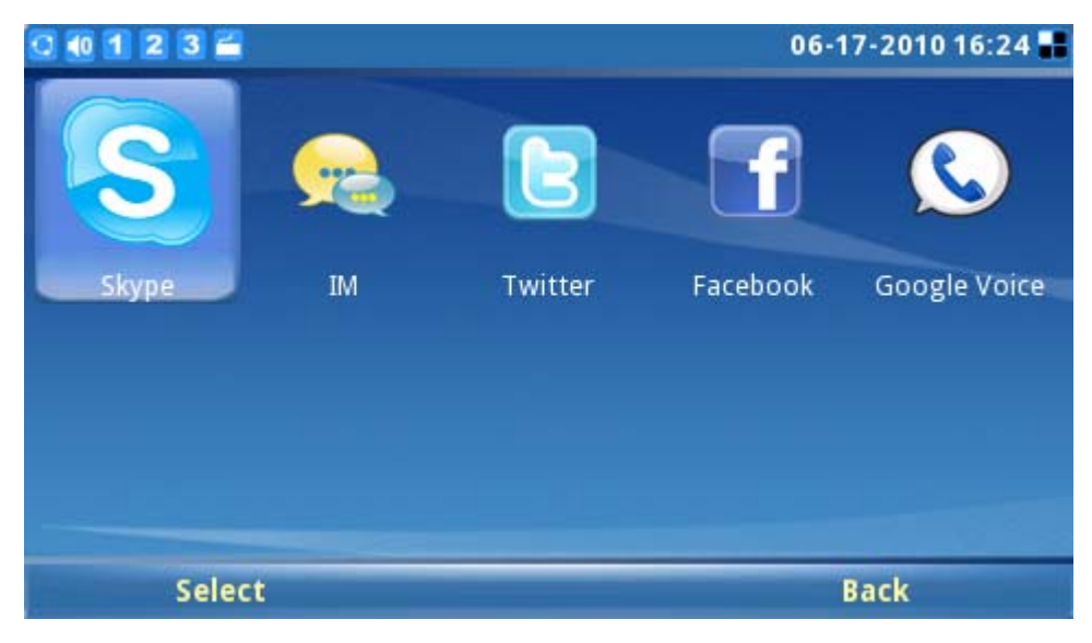
Figure 2: Skype Application via MENU->SOCIAL NETWORKS