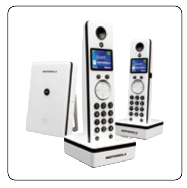
D802 - Twin Pack