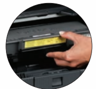
Cost effective with high-yield replacement toner cartridges