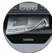
Automatic two-sided printing, scanning and copying