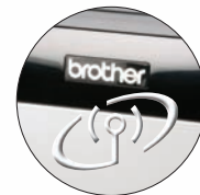
Enjoy the convenience of wireless printing, scanning and PC-FAX